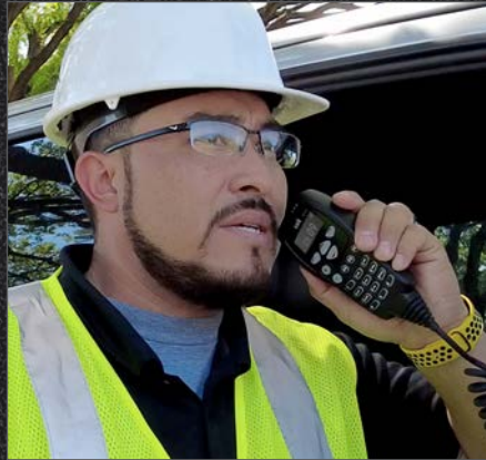
Intelligent vehicle network and edge computing platform in a familiar radio form factor 1 .