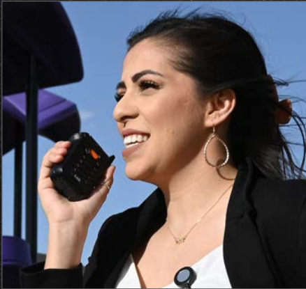
Compact, ruggedized, wearable broadband communications device for heads up operation..