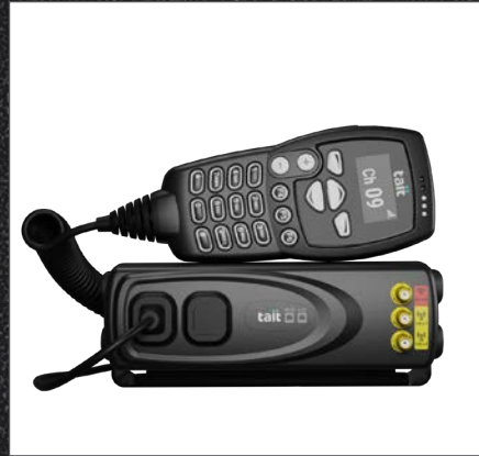
TAIT AXIOM Mobile 1 provides a choice of vehicle installation and user interface options.