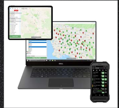
Tait TeamPTT application available for Android and iOS smart devices.