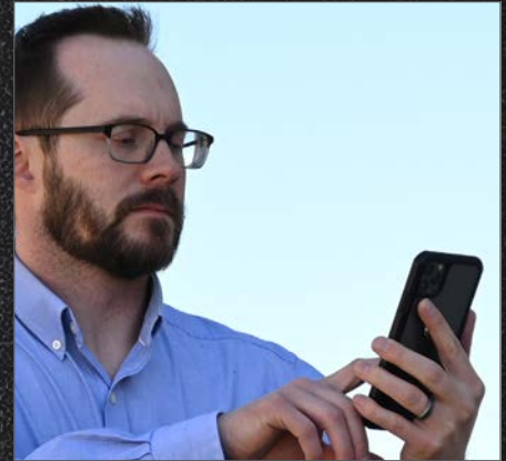
Broadband smart devices can bridge the gap between networks, devices and user locations.